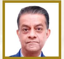
Dr. S Radhakrishnan