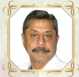
Dr. Naresh Trehan

A Trailblazer who nurtured our cardiology center from infancy to adulthood & excellence